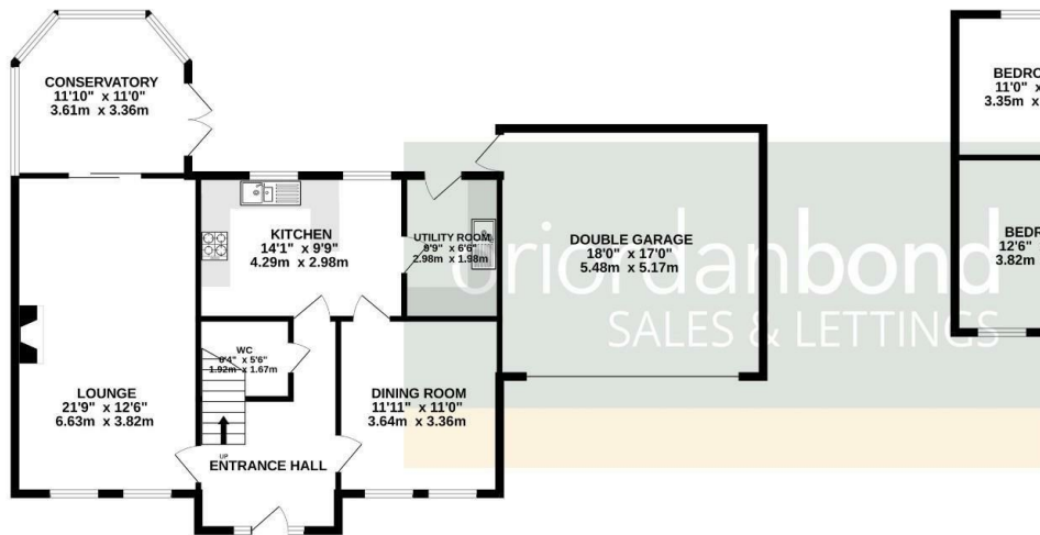
GROUND FLOOR 1163 sq.ft. (108.0 sq.m.) approx.